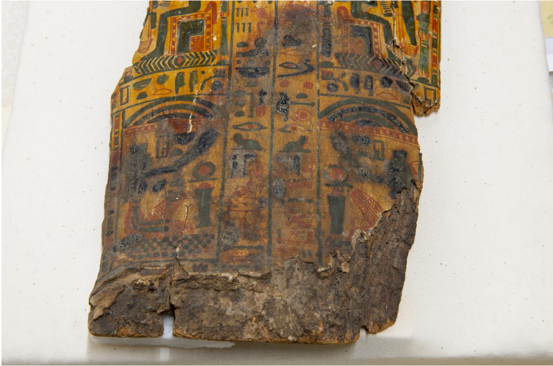
Fig. 5: Mummy-cover Footend