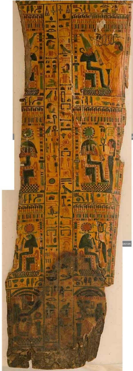
Fig. 6: Mummy-cover Inscriptions