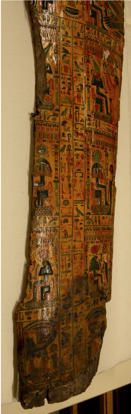
Fig. 4: Mummy-cover Lower section