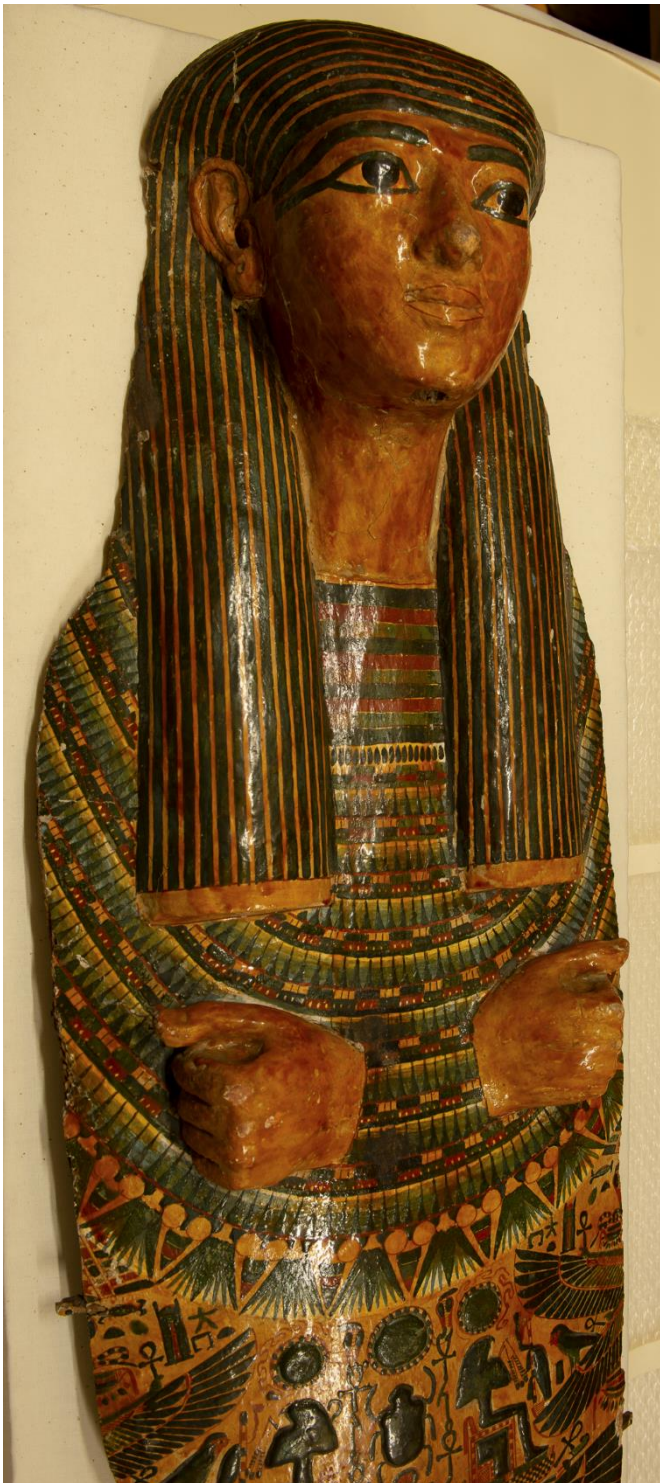
Fig. 2: Mummy-cover Headboard and upper section