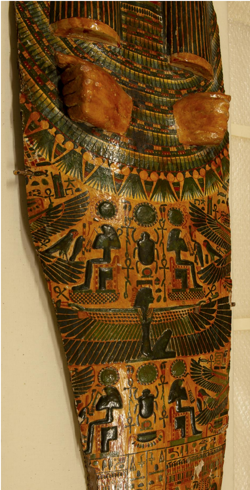
Fig. 3: Mummy-cover Central panel